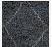
GREY / WHITE