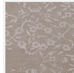
LIGHT MINK / BISQUE