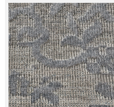
NICKEL / CARBON