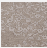
LIGHT MINK / BISQUE