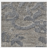
NICKEL / CARBON