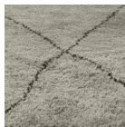
Heathered Grey / Twilight