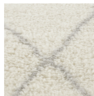
Natural / Nickel