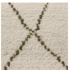
Bisque / Cafe